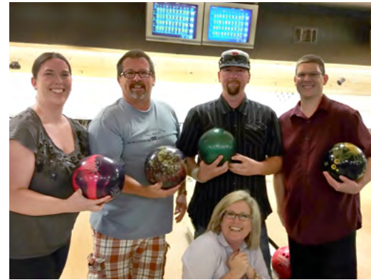
Bowling for dollars 1st ANNUAL CHARITY BOWL 2015

Employees and family members from our Portland office assembled 120 lunches as part of the #HashtagLunchbag movement. Lunches were then served at New Avenues for Youth, an organization that empowers youth to exit street life by helping build life skills.