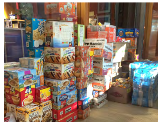
Boxes of meals for families @ BELLEVUE LIFESPING

Employees in our Seattle and Irvine offices participated in a company-wide Share the Love event by organizing food drives. Seattle's drive was in partnership with Bellevue LifeSpring—their mission is to foster stability and self-sufficiency for Bellevue's children. And Irvine's food drive benefited the Boys & Girls Clubs of Tustin.