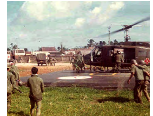
We volunteered 28 hours @ SACRAMENTO STANDDOWN

Portland employees and some of their family members spent the morning volunteering at the Oregon Food Bank. In just a few hours, the group was able to sort and bag 30,875 lbs of potatoes; enough for 25,729 meals! The Oregon Food Bank provides emergency food to people in need through a cooperative statewide network of hunger-relief agencies.