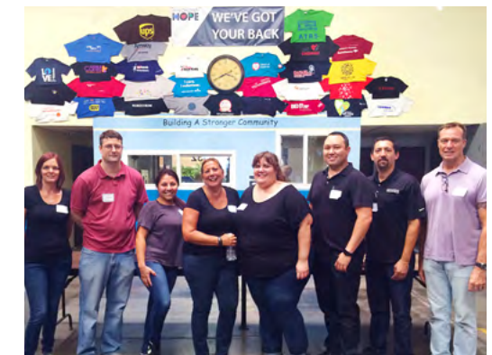
We volunteered 44 hours @ GIVING CHILDREN HOPE

For the third year, Sacramento office employees volunteered at the Sacramento Standdown event at Mather Field, providing homeless veterans with clothing, food, medical, legal and mental health assistance to help rebuild their civilian lives.