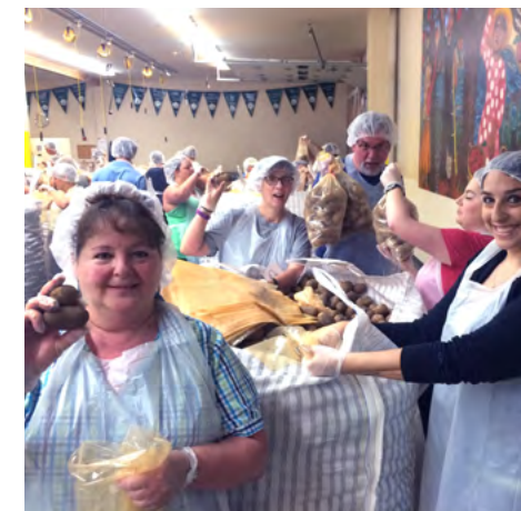
We volunteered 54 hours @ OREGON FOOD BANK

Portland employees and some of their family members spent the morning volunteering at the Oregon Food Bank. In just a few hours, the group was able to sort and bag 30,875 lbs of potatoes; enough for 25,729 meals! The Oregon Food Bank provides emergency food to people in need through a cooperative statewide network of hunger-relief agencies.