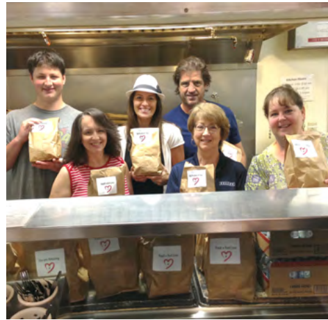
#HashtagLunchbag for NEW AVENUES FOR YOUTH

Employees and family members from our Portland office assembled 120 lunches as part of the #HashtagLunchbag movement. Lunches were then served at New Avenues for Youth, an organization that empowers youth to exit street life by helping build life skills.