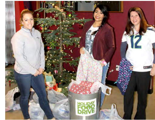
Holiday food & clothes drive for HOMELESS YOUTH IN SEATTLE