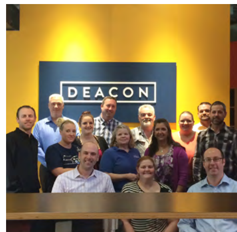
We volunteered 32 hours @ BELLEVUE LIFESPING

Employees in our Seattle and Irvine offices participated in a company-wide Share the Love event by organizing food drives. Seattle's drive was in partnership with Bellevue LifeSpring—their mission is to foster stability and self-sufficiency for Bellevue's children. And Irvine's food drive benefited the Boys & Girls Clubs of Tustin.