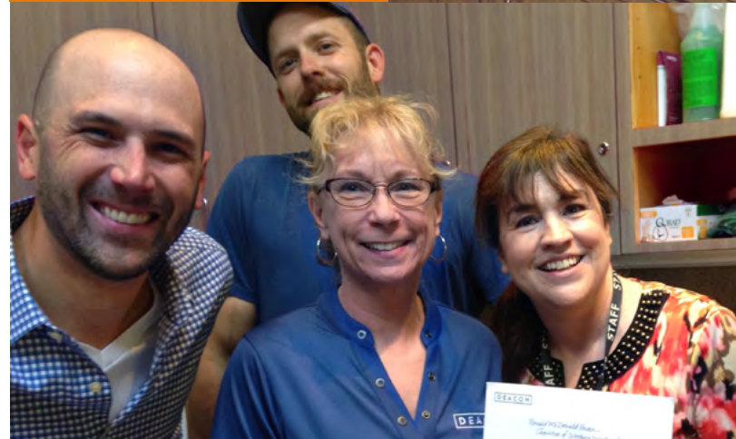
RONALD MCDONALD HOUSE CHARITIES OF WESTERN WA & AK